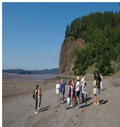
Tour at Wassons Bluff

Geological time did not end millions of years ago; it continues to play a role in each of our daily lives. Our geology is the foundation of our dramatic landscape, our natural heritage, and it draws visitors from around the world.