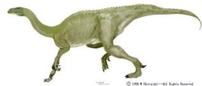
Plateosaurus (similar to local dinosaurs)

The Nova Scotia Museum Heritage Division has completed an Interpretive Master Plan that articulates this relationship. The Museum has been re-examining its role in the interpretation of the province's story to identify opportunities to renew and re-brand our programs, exhibits and services.